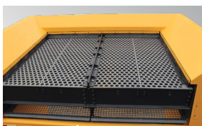
Punch plates (top screen)