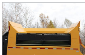
Wings plates extensions