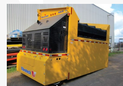
Steel skirt for wheels